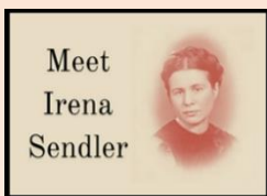
Meet Irena Sendler

Registration Required- Max. 6 Per Session